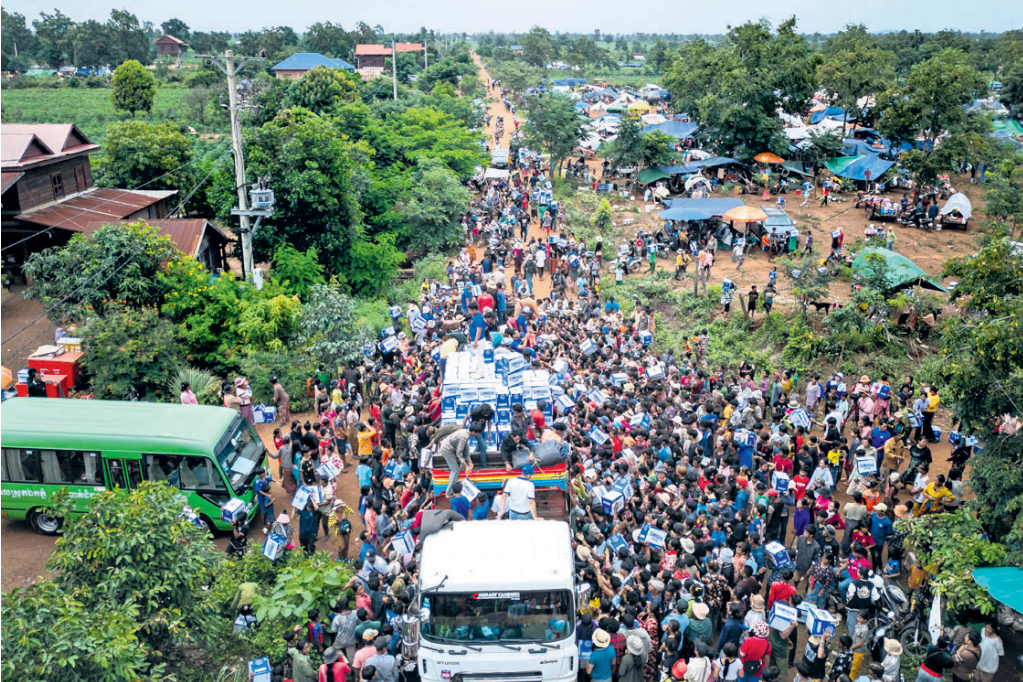
Displaced Cambodians receive water at the Battkhao Resettlement Camp in Oddar Meanchey Province, Cambodia, Saturday

On Saturday, President Donald Trump posted on Truth Social that he has talked with the leaders of Thailand and Cambodia and suggested he