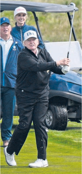
President Donald Trump plays golf at the Trump Turnberry golf course in Turnberry, Scotland, Saturday

Trump has fed his base with conspiracy theories for years, including the false “birther” claim that former President Barack Obama was not born in the United States. Trump's advisers fanned conspiracies about Epstein, too, only to de-