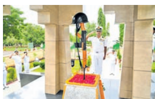
POST NEWS NETWORK

Chilika, July 26: INS Chilka commemorated Kargil Vijay Diwas with solemn reverence to honour the valour and sacrifice of the Indian Armed Forces during the Kargil War of 1999.