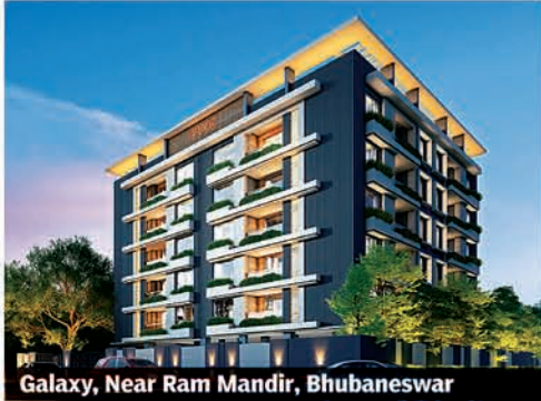
Galaxy, Near Ram Mandir, Bhubaneswar

We have our four core values such as reliability, quality, customer-centric, and continuous upgradation. So, our interactions with our customers, colleagues, channel-partners, vendors, and society at large are defined and enriched by these values. We always give handovers on time and have never given customers any space to complain about our services. We have the approvals from RERA. Our biggest flex is that we have zero complaints against ourselves in RERA.