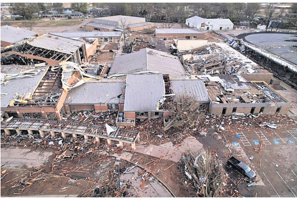
An aerial view of the damage following a tornado in Wynne, Arkansas

Rome: Authorities in Italy have blocked chatbot ChatGPT with immediate effect in the country. With this, Italy becomes the first European country to block the advanced Artificial Intelligence software, which is capable of emulating and elaborate human conversations among other actions. Italian data protection authority on Friday (local time) has said that it is blocking the Microsoft backed chatbot developed by US start up OpenAI and will investigate whether it complied with the country's General Data Protection Regulation. Since its launch in November last year, ChatGPT has become a sensation due to its ability to produce believable-sounding answers to queries as well as a variety of content, including poetry, academic essays, and summaries of lengthy documents when requested by users.