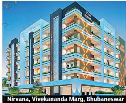
Nirvana, Vivekananda Marg, Bhubaneswar

The first challenge was that I was a first-generation entrepreneur. So, I did not possess any qualities of an entrepreneur; like financial discipline. Financial discipline is an essential and important characteristic of an entrepreneur. We must be rigid in following financial discipline as it is essential to run a successful business. Moreover, because I didn't have any experience, I did not get any bank loans. This is usually the biggest challenge of an entrepreneur.