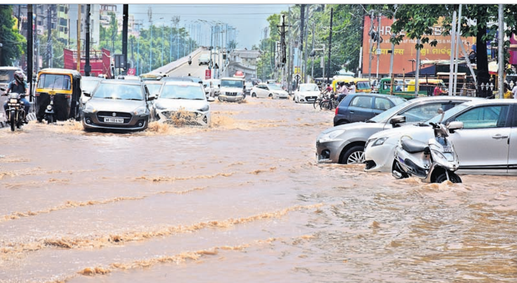
ROAD OR RIVER: A stretch near Bomikhal in Bhubaneswar got inundated following torrential rain, Saturday, much to the inconvenience of commuters, Saturday