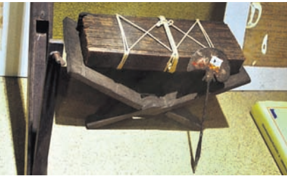
Original palmleaf manuscript of Siddhanta Darpan at Odisha State Museum